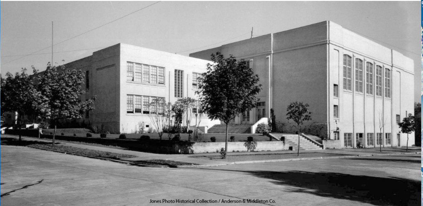
Photo above is from 1931 when the school was located adjacent to the AHS campus. The present-day school opened in 1979 and is located at 100 Lindstrom St. in South Aberdeen. Doors open at 1:30 p.m. Sunday, January 28 -- 100 years to the day that Miller Junior High began serving students in our community.